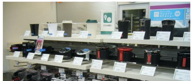
Image of sample display