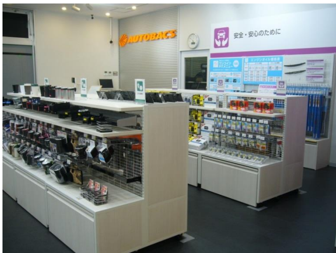
Display furniture with a height of 1,200 millimeters (AUTOBACS IWAKUNI Store)