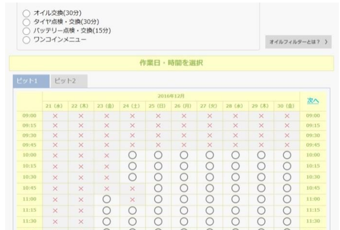
Screen image of online reservation for pit services

In the exchange and installation services of parts and consumables offered at conventional stores, the waiting time tended to be long, causing customer dissatisfaction. In the new stores, however, the installation and replacement services are offered on a reservation basis to eliminate unnecessary waiting time. In line with this change, customers are now able to make a reservation via phone or online for pit services, including conventional oil change, tire, battery, and “one-coin” services (those that can be purchased with one coin), such as water-repellent finishing of speed glass. In addition, the reservation time slot is now available on a 15-minute basis, instead of the previous 30-minute basis, which AUTOBACS believes will improve convenience for customers.