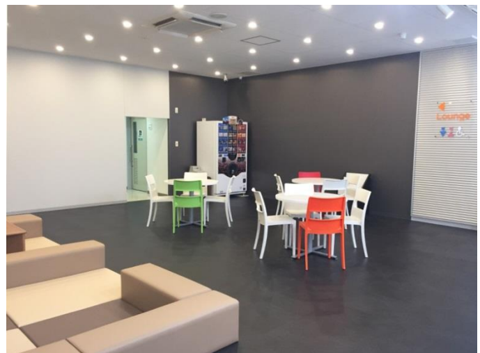
Waiting area (AUTOBACS IWAKUNI Store)