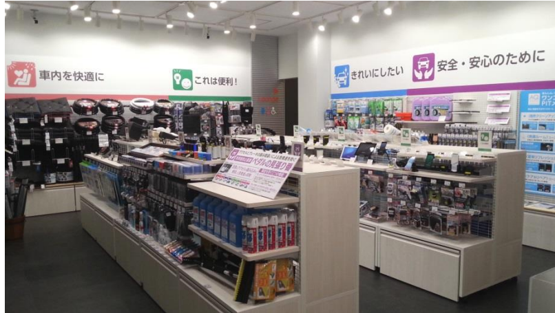
Selling area (AUTOBACS AKITA YURIHONJO)