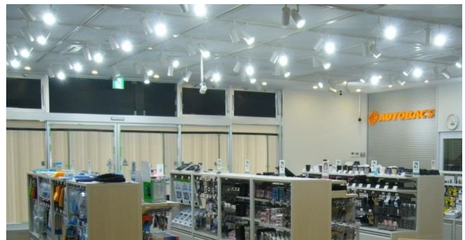
In-store lighting (AUTOBACS IWAKUNI Store)

The waiting area for customers during the pit service produces a calm and simple space like a lounge and also offers a kid's space so that customers with small children can also stay comfortably.